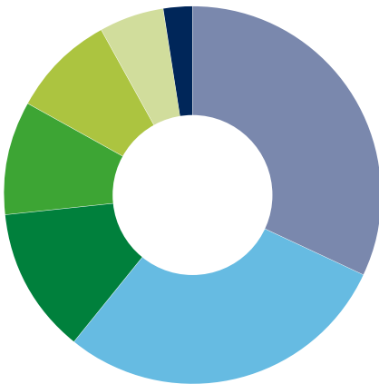
CHART 1 3 MULTI-SECTOR INDEX

asset class exposure of the Multi-Sector Market Index, whereas Chart 2 shows the diversification of Perpetual’s Diversified Real Return Fund.