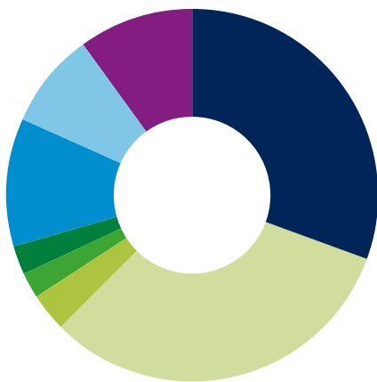
CHART 1 KEY