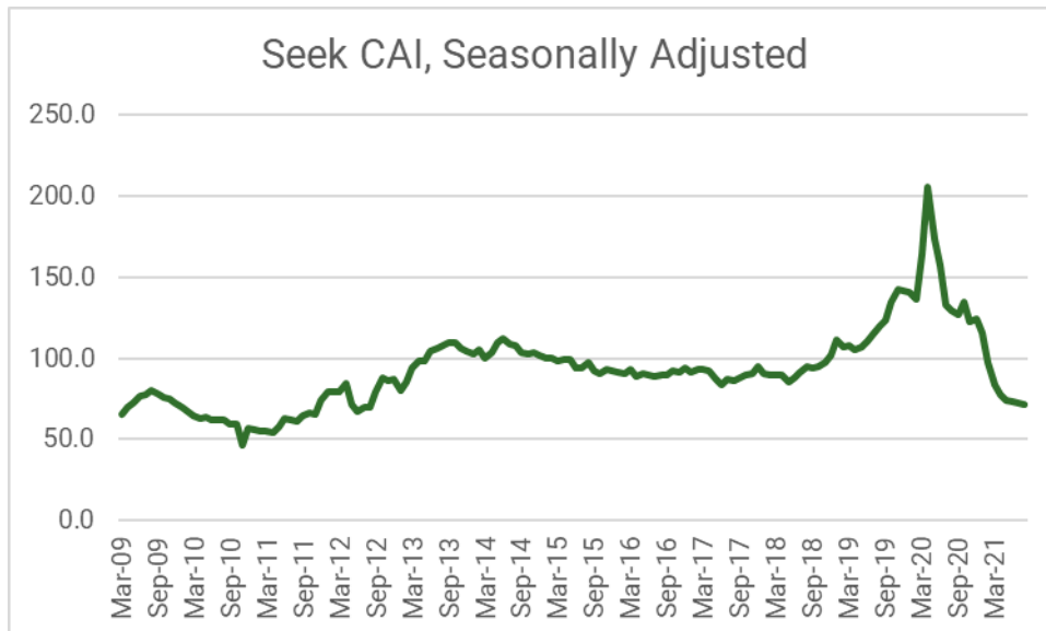
Source: Seek Employment report.

A similar story could be seen by Seek's candidate availability index which is making new lows every month.