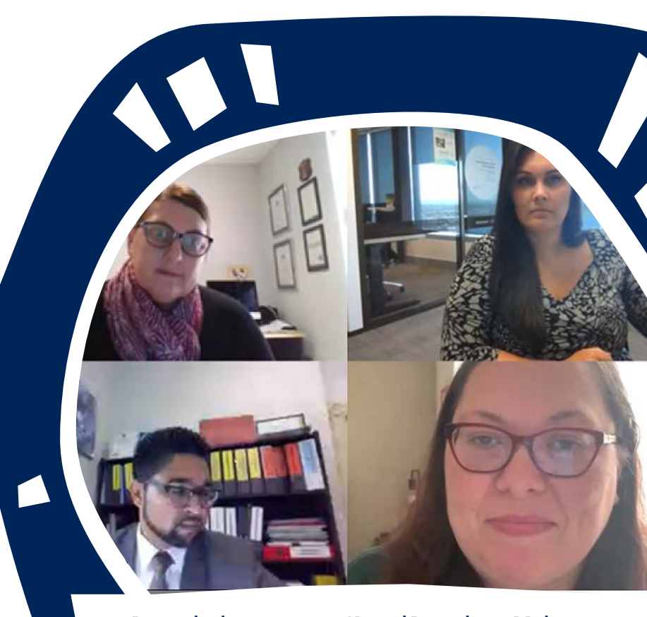
Perpetual webinar recognising National Reconciliation Week in 2020.

3. Mission Australia, National Aboriginal and Torres Strait Islander Youth Report: Youth Survey 2019.